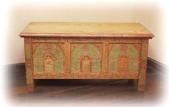
Hand Carved Oak Blanket Chest, Circa 1650

Antique Restoration & Refinishing Services available!