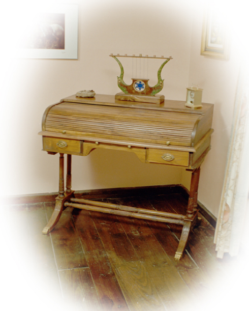
Duncan Phyfe Roll top, Circa 1830

Antique Restoration & Refinishing Services available!