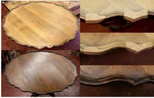
Broken Toe of Table Before & After

This Pie crust table arrived with broken toes and missing pieces of pie crust top, as well as a worn off finish on the surface with several stains and scars. Each of the missing toes and crust sections were carefully replaced, carved, and color blended, then the surface finish was removed and refinished carefully preserving the finish on the rest of the table that is still in good condition.